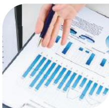
Logistics, Finance & Services