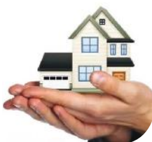
Property & Investment