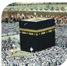
Travel & Tourism