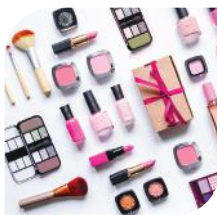
Pharmaceutical & Cosmetics